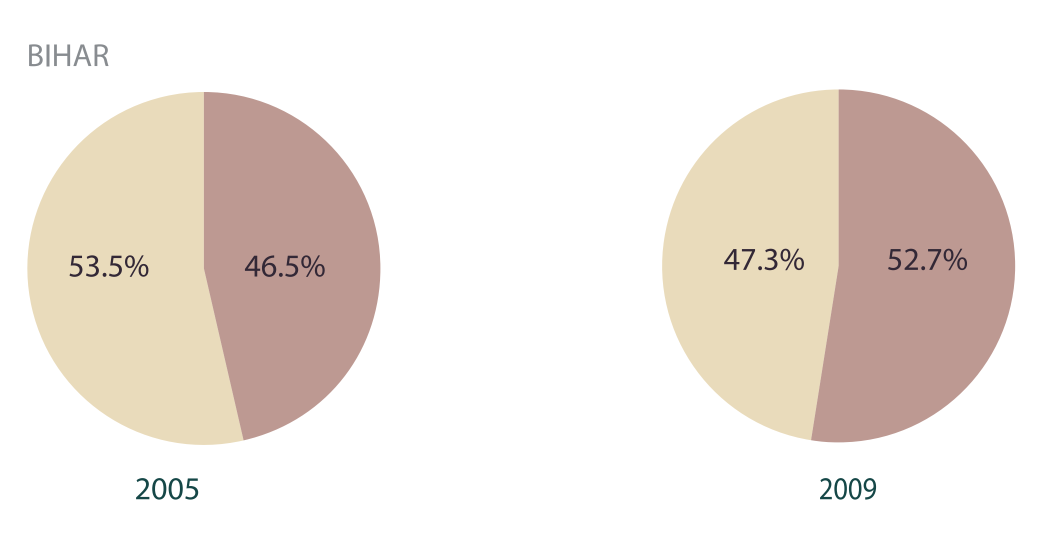
In 2005 voter turnout 46.5% & 2009 data increased to 52.7%

In 2005 election 43% have not voted .Same data repeated in 2009